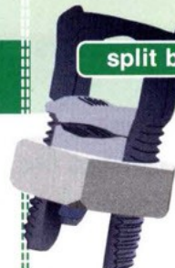
split bolt connector